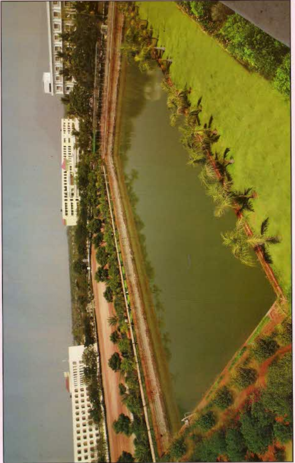
Amirthavarshini Rain Water Harvesting Plant