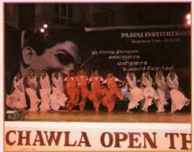
CHAWLA OPEN TH