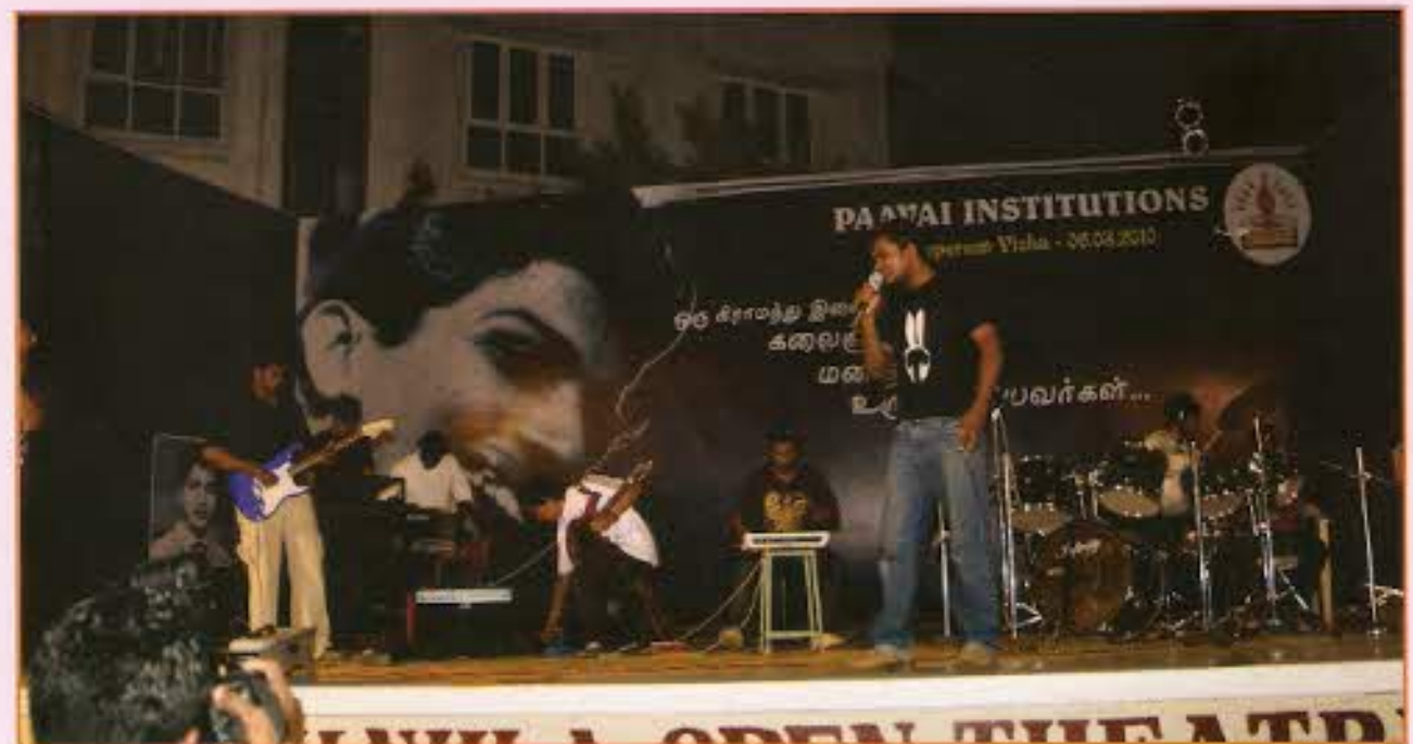
CHAWLA OPEN THEAT