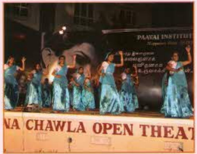
NA CHAWLA OPEN THEAT